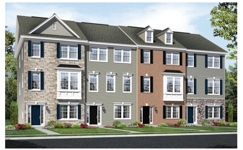
Elevation H, A, G, D