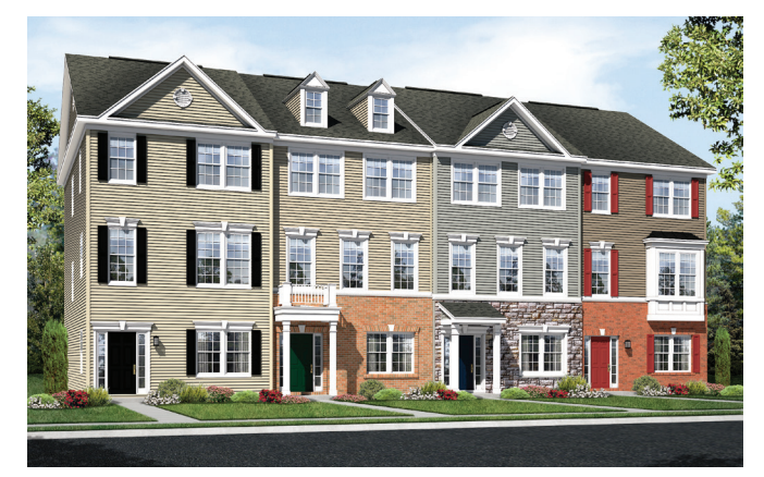
Elevation B, E, F, C

The Kimberly plan offers three floors of generous living space. On the main floor, an open dining room and spacious living room flank a charming kitchen with a roomy center island and optional gourmet features. Upstairs, enjoy a convenient laundry, a full bath and a relaxing master suite with an optional deluxe bath. The lower floor boasts an expansive rec room, which can be optioned as an extra bedroom.